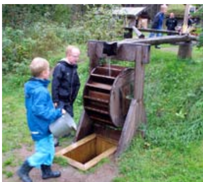
The children's Bergslagen