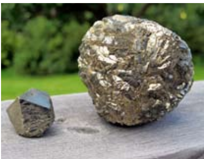
Pyrite (iron & sulphur), FeS 2 – look how beautiful the mineral can crystallize!