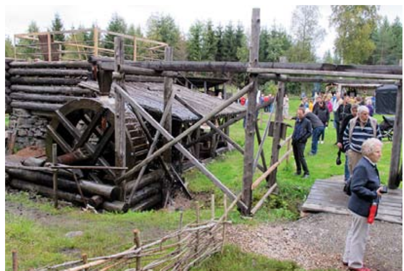
The reconstructed medieval blast furnace