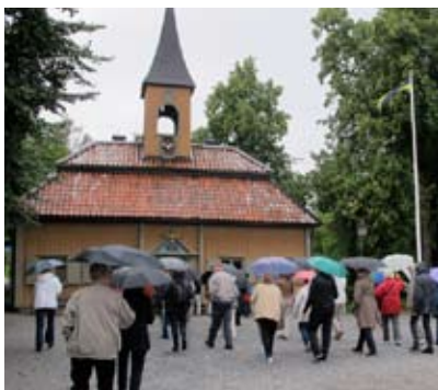
Gathering in front of Sigtuna town hall, the smallest in Sweden. It was inaugurated in 1744, and became a listed building in 1971